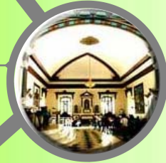
Nuestra Señora de Manaoag