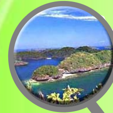
Hundred Islands National Park